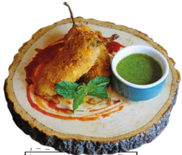
JALAPENO POPPERS (VEGETARIAN) THB 240