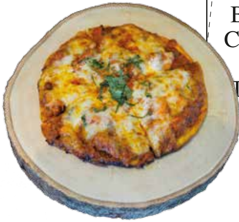
BUTTER CHICKEN PIZZA THB 280