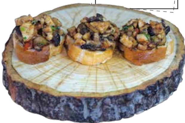
BUTTON & CHICKS THB 230